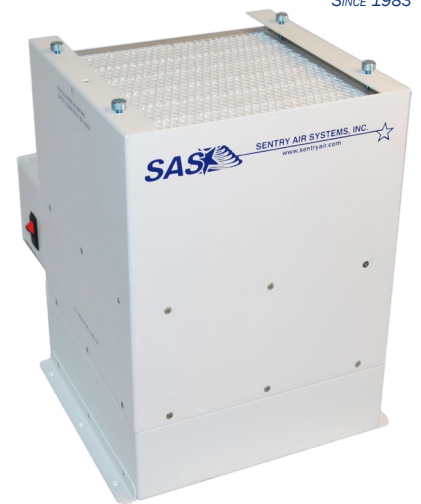
Model 200 Mist Collector