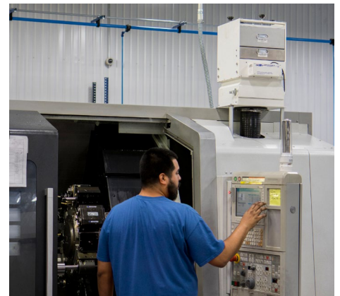
Model 300 Mist Collector pictured above