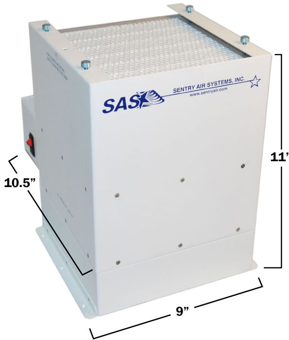
Dimensions are approximate